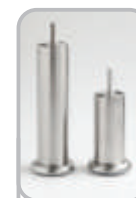
Round aluminium leg