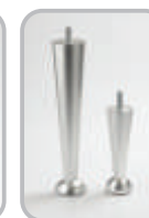
Aluminium leg Champagne