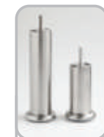
Round aluminium leg