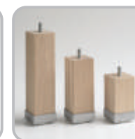
Wooden leg with aluminium