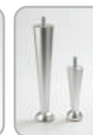
Aluminium leg Champagne