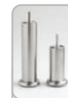
Round aluminium leg